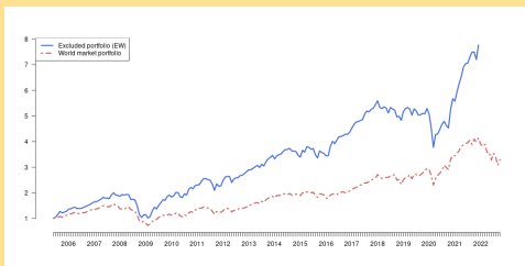
Exclusion Portfolio vs World Market